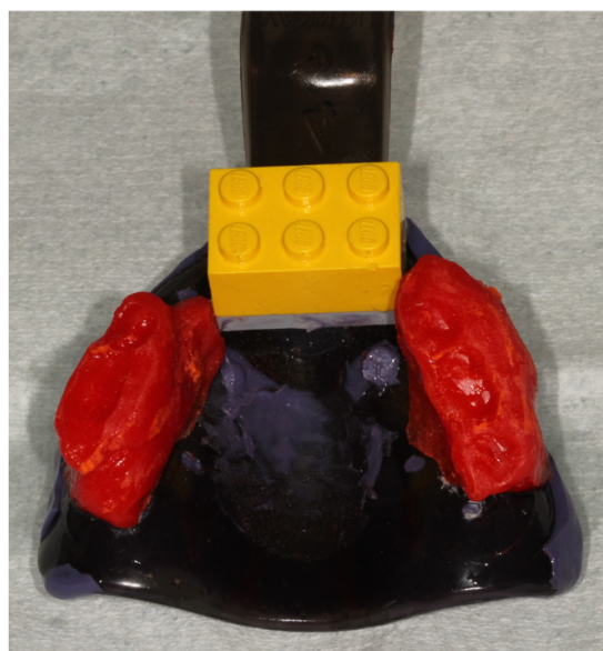
Fig. 3. The system of guidance attached on the contra-angle. The two legs of the fork are located on either side of the drilling axis. They can be inserted in the guide corresponding tubes. Optionally, a calibrated plastic wedge (white part) may be used to control the insertion depth.