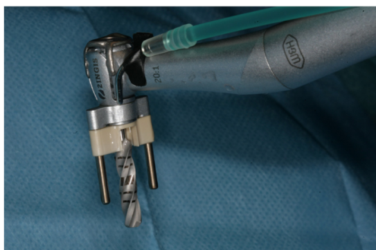
Fig. 1. Dental impression tray. As a spatial reference and a radiopaque marker, a Lego® brick is attached in the anterior position. In the posterior locations, auto-polymerizing resin wedges stabilize the impression tray during the CBCT exam.

This system was used by the authors to place 67 implants (36 zircon implants from Paris Implant® [Marnay, France] in ZIR-ROC clinical study, 23 titanium implants from Straumann® [Basel, Switzerland] and 8 titanium implants from Zimmer® [Florida, USA]) in 35 patients (28 patients for zircon implants and 7 patients for titanium implants). The clinical study has been conducted in full accordance with ethical principles. It was undertaken with the understanding and written consent of each patient and was independently reviewed and approved by the national ethics committee (2010-A00989-30/MS1). In the case where the edentulism was limited to three teeth, we used a small field cone beam device (Planmeca ProOne®, Helsinki, Finland). For more extensive edentulism or completely edentulous jaws, we used a wide-field CBCT device (NewTom 5G®, Verona, Italy). The insertions were