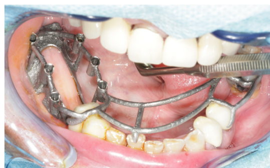
Fig. 2. Using the pilot zircon drill. A single implant was placed with this guide having thus only 2 twin tubes. Note that the guide was wider than appears on this picture, with stabilizer rods to connect it to lateral teeth.