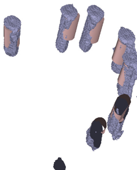
Fig. 5. Visualization of the system accuracy. Superposition of the clinical position of the implants (purple objects) and pre-operative planning (brown cylinders). Image generated with Meshlab ® software from ISTI (Italian National Research Council, Italia).

Unlike some guidance systems in which the surgical procedure may be modified at any time by the surgeon [3], the clinician is forced here to respect and follow the parameters described during the planning stage. Although potentially frustrating to some surgeons, it has the advantage of ensuring the positioning of the implant precisely as it was planned. This reduces the chance of surgeon dependent variability, which can be very appreciated in clinical research studies.